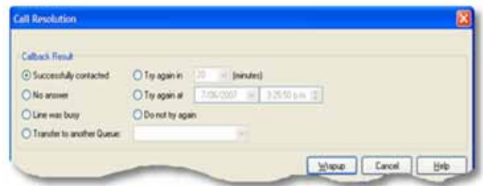
Figure 3. Callback resolution code

Resolution codes help improve the effectiveness of callbacks, as specific information is logged about the call attempt each time the callback is presented. This information can also be reported on a per-queue and per agent basis for future referencing. Gone are the days of hearing a voice message, deleting it, and then having no reportable records available.