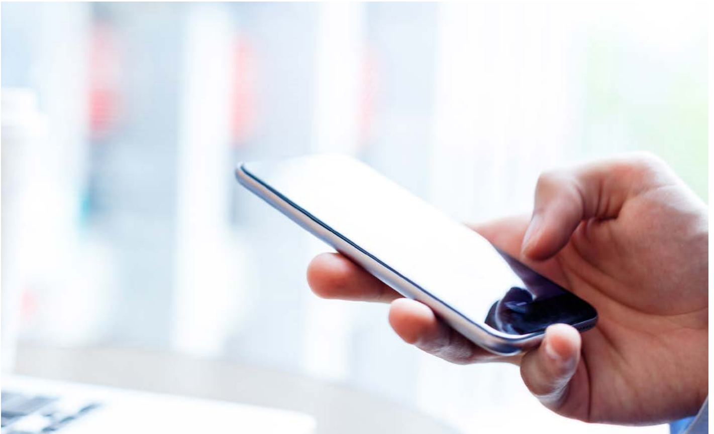
Mobile Testing can ensure a seamless user experience across devices & browsers