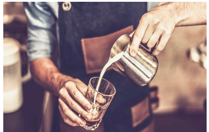
NEC ID can enable more efficient, personalised service

Biometrics is much safer and secure than traditional authentication methods. You cannot steal, forget or have stolen your face, voice or fingerprint and hacking is difficult as biometrics hashed templates are created - NEC does not store the customer's image.