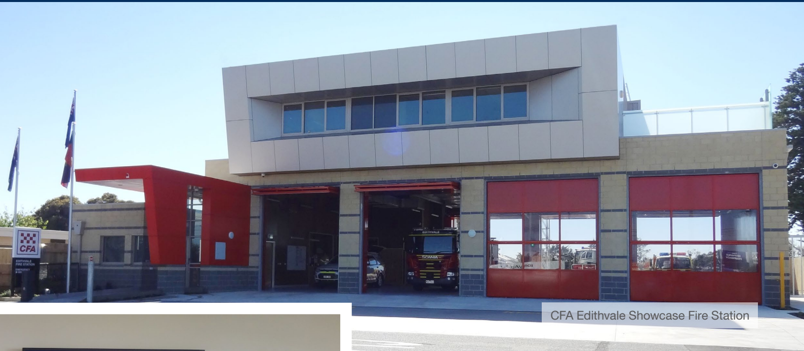
CFA Edithvale Showcase Fire Station