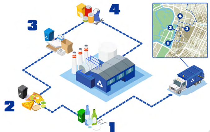
Image: collection route optimization