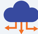
Cloud-First & UCaaS Partners