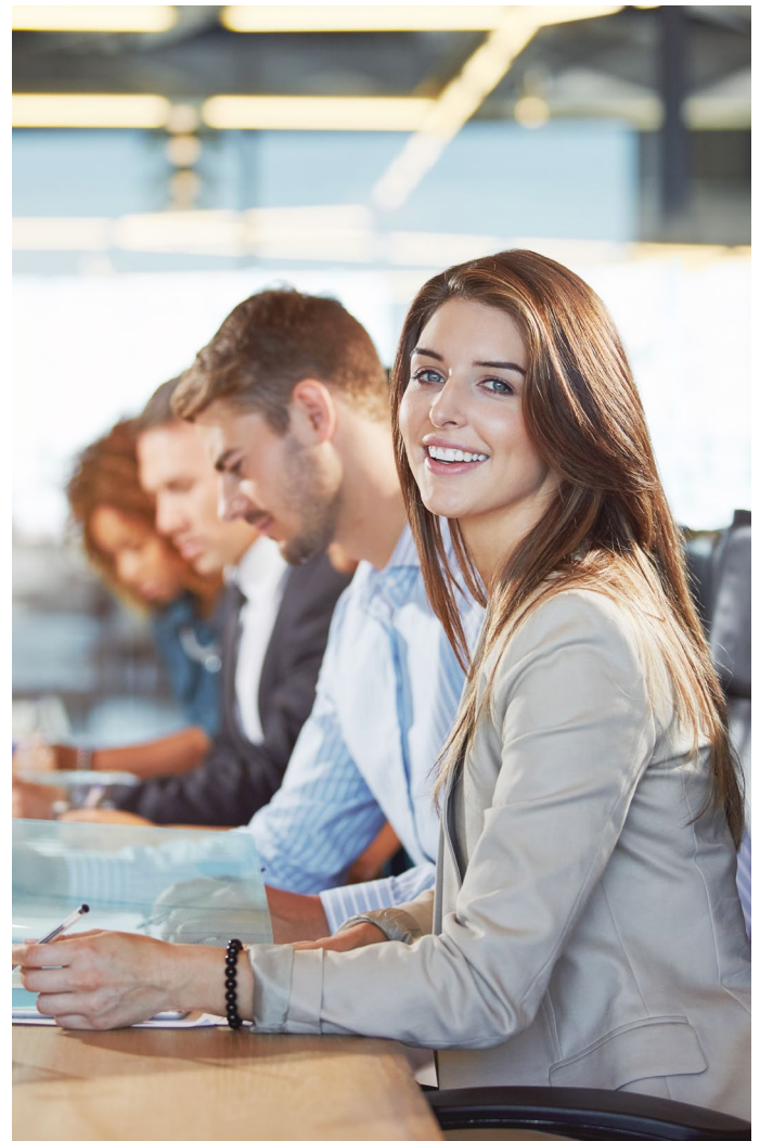
NEC DTS enables you to manage risk more effectively