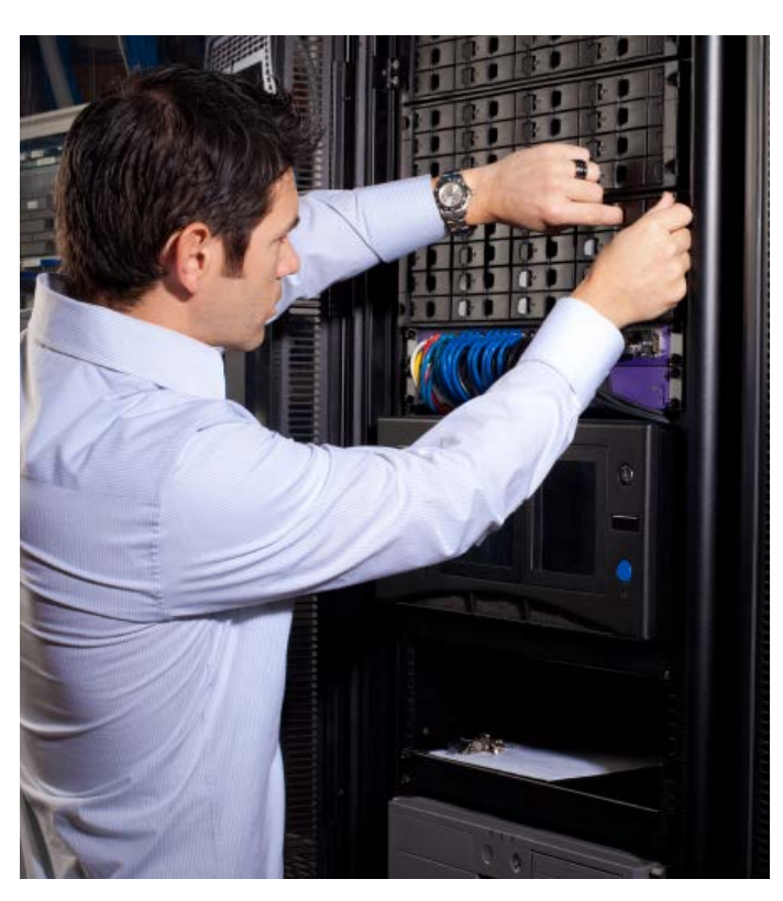
Infrastructure Testing can reduce operational costs and risks