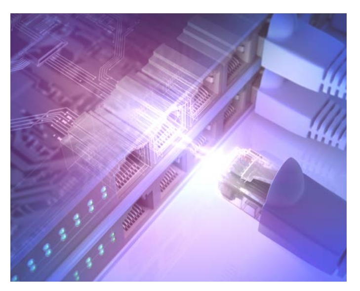
NEC provides the capability to upgrade your network devices

This includes problem management, change management, release management, availability management, capacity canagement & service continuity.