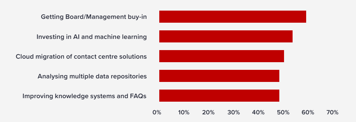
Figure 2: Top CX Priorities in Australia

Irrespective of the self-service touchpoints you employ, human touch and empathy will prevail. Customers still prefer to speak to an agent when in distress or when handling challenging circumstances. Ecosystm research finds that 95% of contact centres in Australia use voice technologies indicating that while Al and Automation technologies are on the rise, many of these technologies will be incorporated within the voice solutions. What organisations will look to do is to empower their agents with technologies (Figure 2) to make them "super-agents".